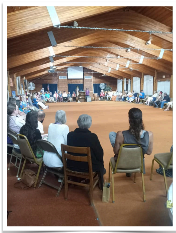
Wisdom Circle Sharing